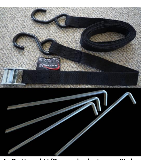
4. Optional H/D cam lock straps, Stakes