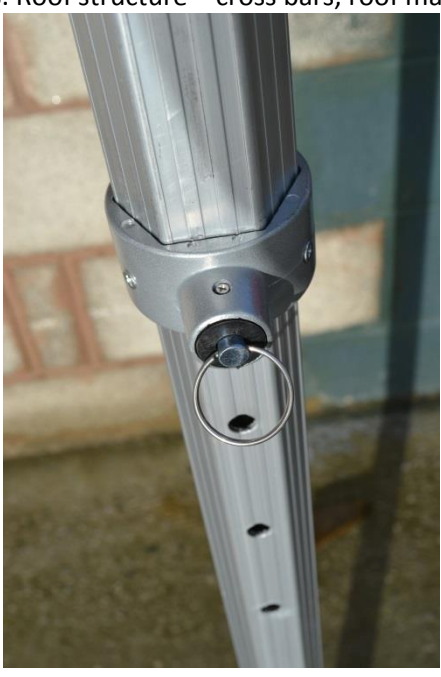
10. Height adjustment