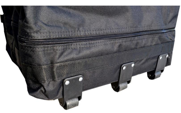
3. Storage bag with solid base and wheels