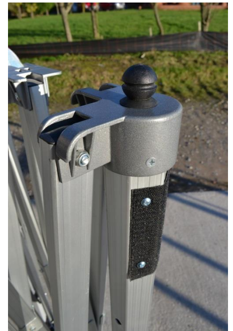
9. Canopy screw down ball/ Rounded corner joint to protect canopy