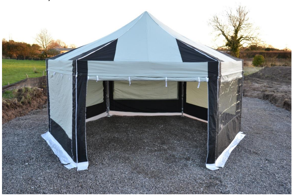
14. 6m Hexagon with sides