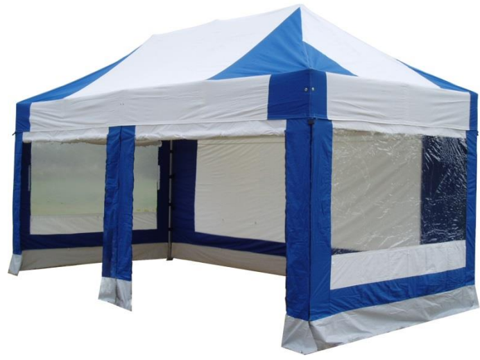
16. 6m x 3m with sides