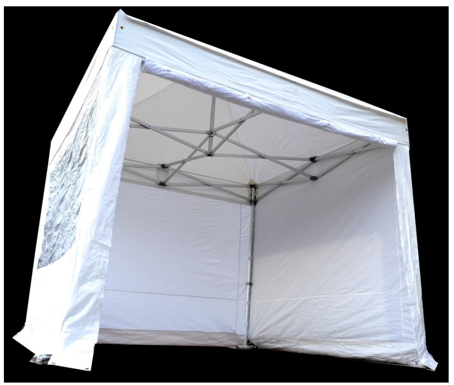
7. 3m x 3m with sides, roof structure