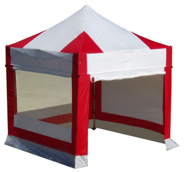
1. 3m x 3m with sides