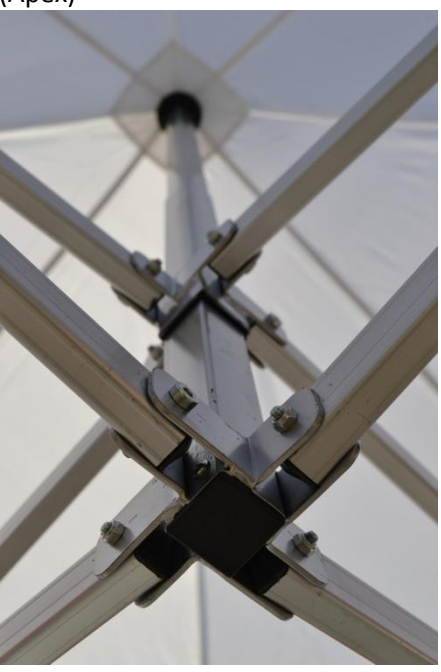
11. Roof mast (Apex)