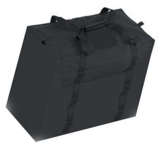
6. Storage bag for sidewalls